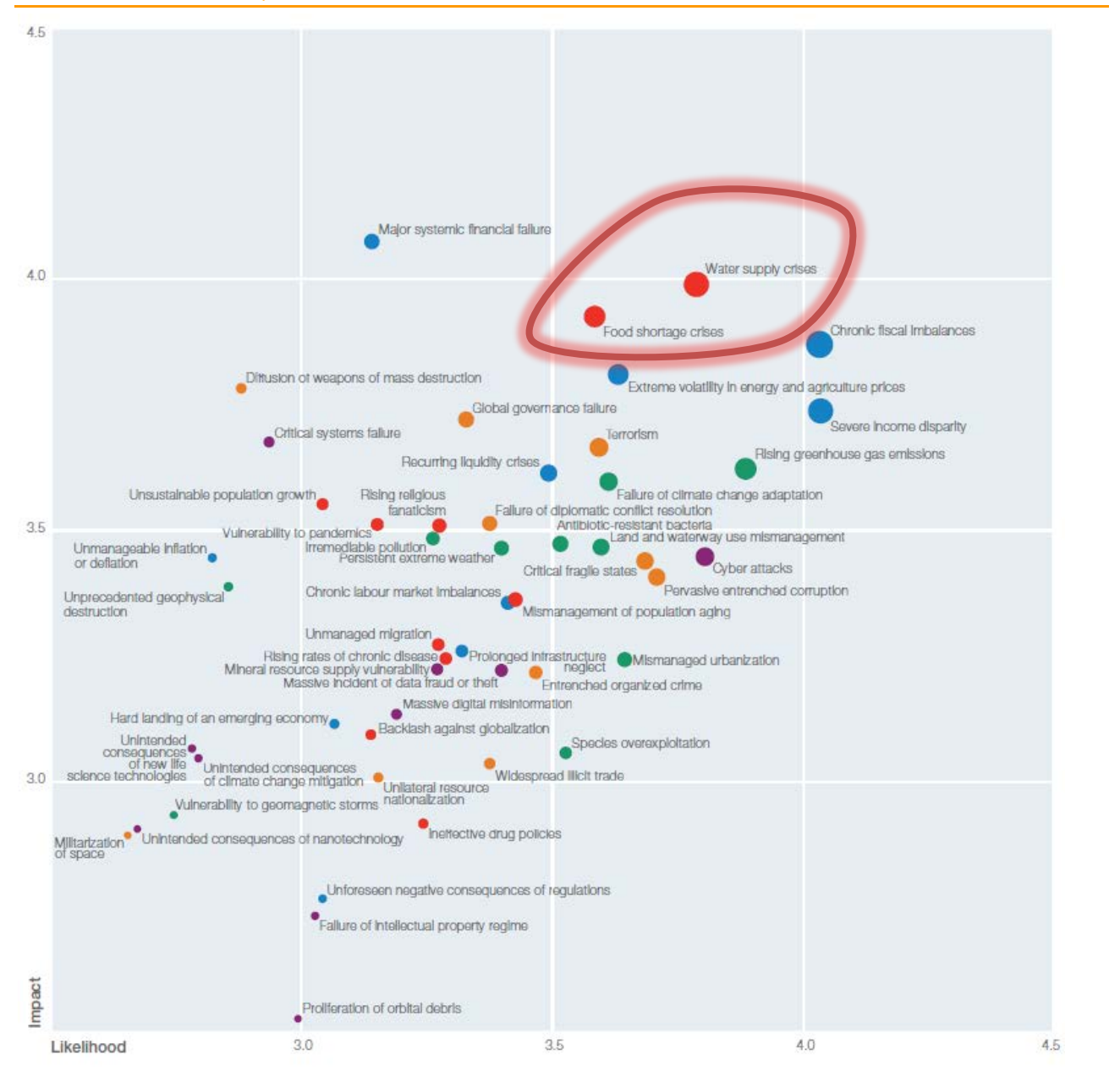
FIGURE 1 50 GLOBAL RISKS, BY LIKELIHOOD AND IMPACT<sup>IV</sup>

Food security is a serious issue, under increasing attention. A report released by Chatham House in December 2012 paints a bleak picture of the world's food, and other resources, explaining that – whether in terms of supply, demand or trade – they continue to face increasing stress and uncertainty<sup>iii</sup>. Similarly, the World Economic Forum's Global Risks Report (2012) makes clear that over the next 10 years, in connection with a number of other serious issues – such as water scarcity, climate change, geopolitics, and shifts in consumer power – food insecurity will be one of the largest risks to society.