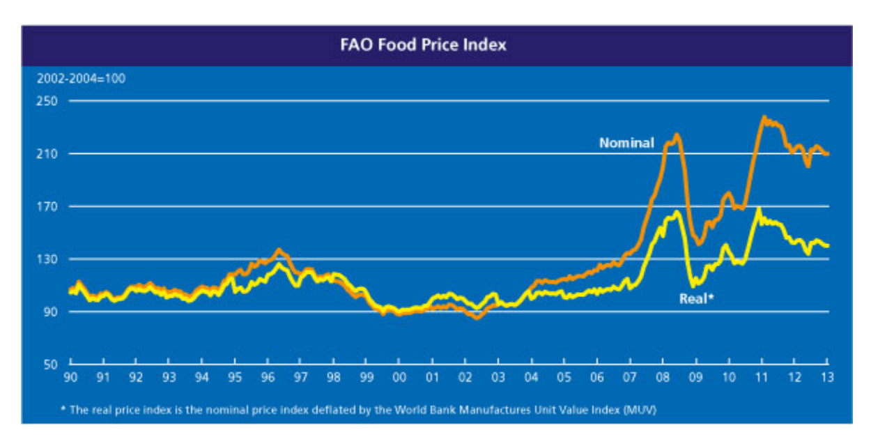
FIGURE 2 WORLD FOOD PRICES SINCE 1990<sup>XVI</sup>

Despite the trend towards higher food prices shown in Figure 3, most of the populations in the UK and the developed world are still able to eat well, and food security is not viewed as a significant problem. However, food price inflation figures are important in determining the overall rate of inflation and therefore the country's wider economic fortunes. Additionally, as food prices continue to rise and people experience lower disposable incomes, money is taken out of other sectors of the economy. In 2011, the Office for Budget Responsibility warned that 'under the assumption that wages don't adjust (to rising oil and food prices), consumption will fall and growth will be lower<sup>xvii</sup>. The UK should also be alert to international food price inflation. Indeed, the global economic recovery, vital to the UK's own recovery, will largely be driven by emerging economies such as China and India, where rising food prices are already an economic threat. Globalisation has led to an unprecedented amount of interdependence and interconnectivity in the global system, bringing immense benefits but also new, systemic risks<sup>xviii</sup>.