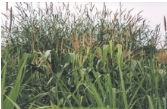
Evaluation of crop and fodder species for suitability as refugia in development of IRM strategy for lowland humid tropics at Mtwapa, Kenya.

vulnerable to Bt maize) must be economically viable and socially acceptable to those making the management decisions at the farm level. After evaluating 30 different alternate hosts for stem borers, preliminary results show Columbus and Sudan grasses to be the most effective refugia for C. partellus and B. fusca . Sorghum was the best host for C. partellus and B. fusca . Napier grasses attracted oviposition, but were not good hosts for larval development.