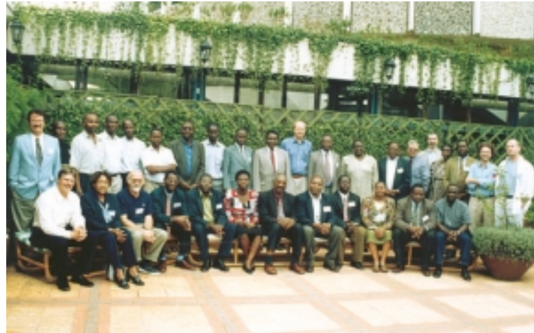
KARI and CIMMYT scientists, together with representatives of the Syngenta Foundation for Sustainable Agriculture, gathered in Nairobi in late November to give presentations on their progress and produce workplans for the coming year.