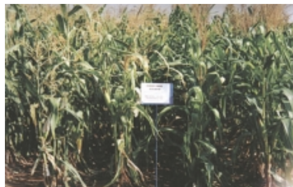
Screening maize OPV under artificial infestation with Chilo partellus at Kiboko, Kenya during 2001B season

In the search for and development of sources of insect resistance, IRMA scientists evaluated 216 genotypes from CIMMYT and KARI, 42 multiple borer resistant (MBR) S4 lines from CIMMYT-Mexico, and 500 MBR/MDR inbred lines from Mexico. These were evaluated during the 2001A season for adaptation, resistance to Chilo partellus and Busseola fusca , and leaf toughness. Crosses were also made to two testers