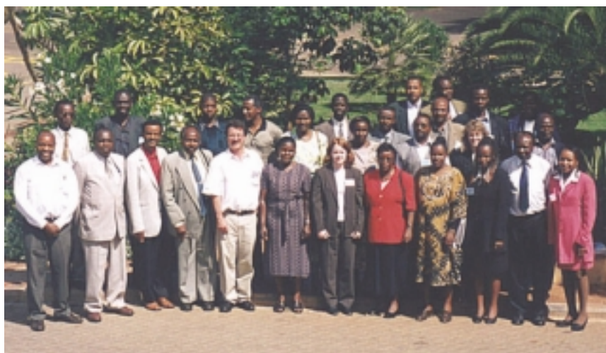
Scientists, journalists, and administrators from Ethiopia, Uganda, Ghana, Kenya, and several international organizations came to Nairobi to participate in the workshop on "Enhancing Scientists Communication with the Media."