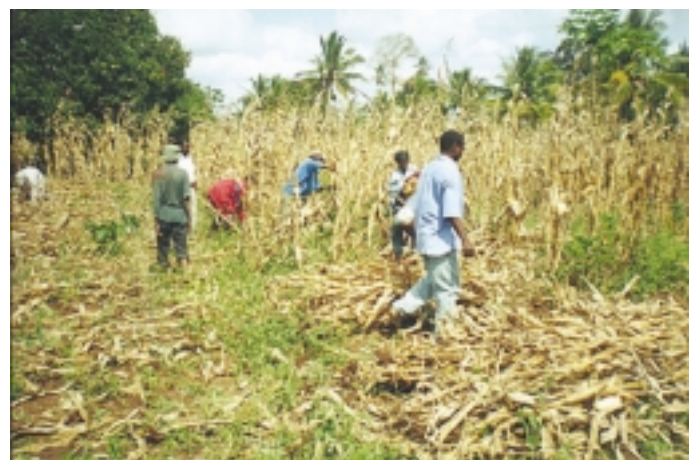
Maize is harvested to be weighed to compare plots that are vulnerable to stem borer infestations to the control group treated with insecticide. This allows scientists to determine the actual levels of losses inflicted by the borers in farmers' fields.

times. During an introductory visit, the field was agreed upon with the farmer and a short questionnaire about farm and farmer characteristics was administered. Two adjoining plots of 50 m 2 were staked out. During a second visit, one subplot was treated with a systemic insecticide for borer control at about 2-3 weeks or at the 6-leaf stage. When required, the treatment was repeated. During this visit, plants and dead hearts were counted, and damage parameters observed.